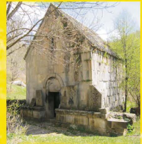
The church of Saint Astvatsatin